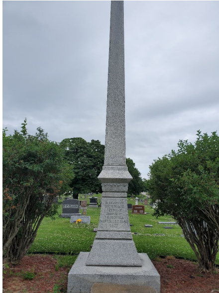
Confederate Monument in Cemetery at Warrensburg.