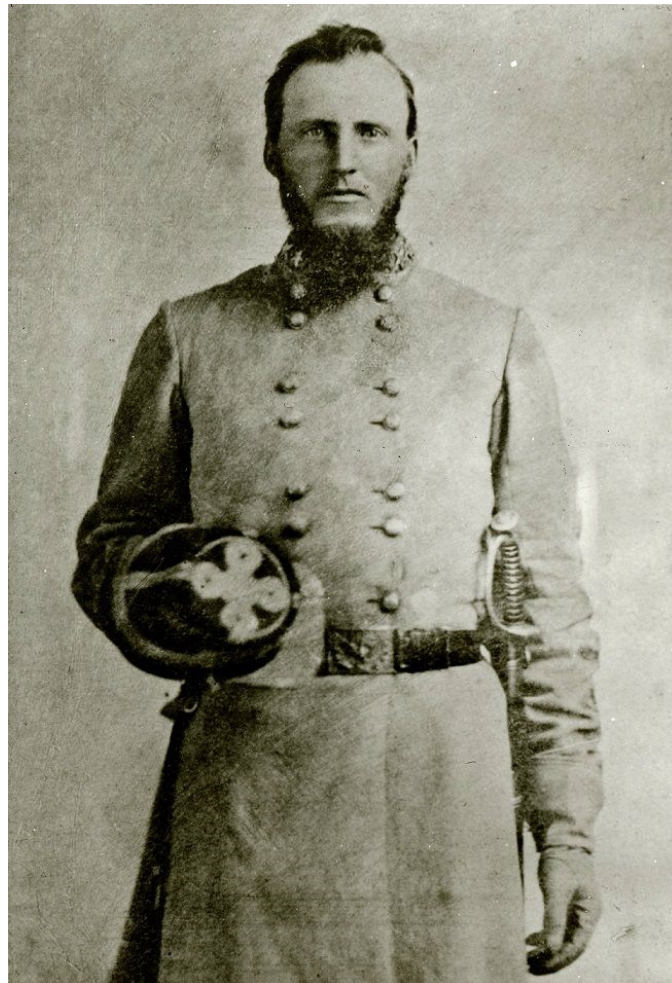
Francis Marion Cockrell General and US Senator.